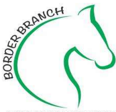
AUSTRALIAN STOCK HORSE SOCIETY